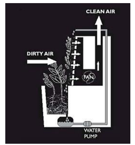
Fig.7 The basic mechanics of a biofiltration wall.

These root microbes remove airborne volatile organic compounds (VOCs), while foliage absorbs carbon monoxide and dioxide. The plants' natural processes produce cool fresh air that is drawn through the system by a fan and then distributed throughout the building. A variation of this concept could be applied to green façade systems as well, and there is potential to apply a hybrid of systems at a large scale.