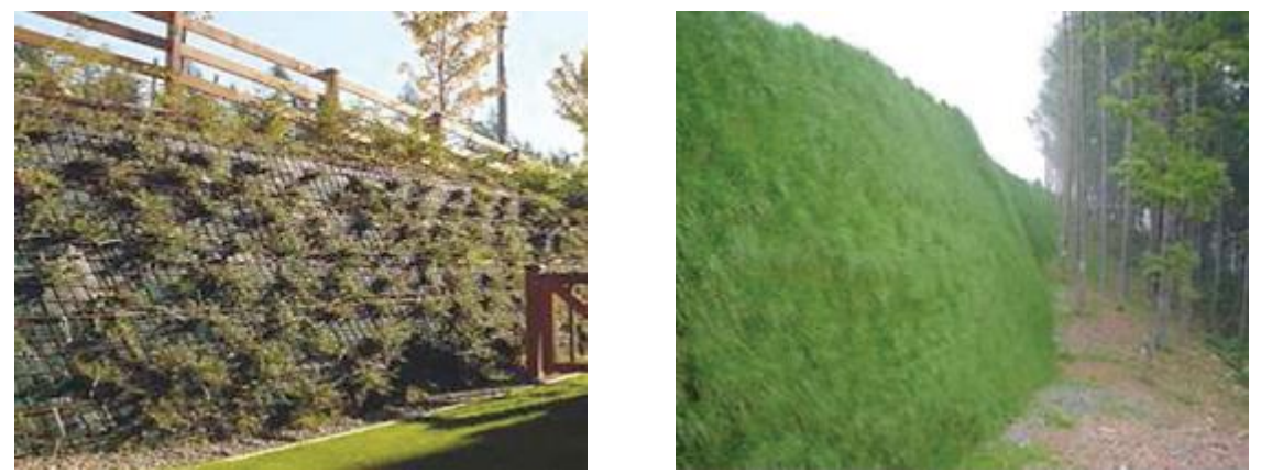
Fig.8 landscape walls - typically used for noise reduction

These walls are an evolution of landscape 'berms' and a strategic tool in an approach to 'living' architecture. Landscape walls are typically sloped as opposed to vertical and have the primary function of noise reduction and slope stabilization. They usually are structured from some form of stacking material made of plastic or concrete with room for growing media and plants.