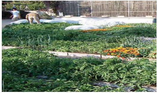
Fig.10 green walls designed for agriculture