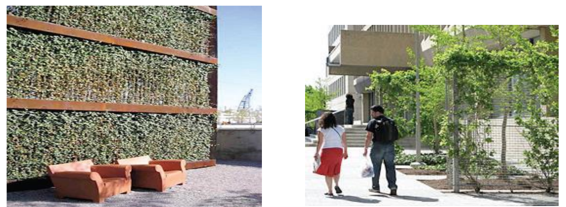
Fig.9 Some Improved Aesthetics

Aesthetic value relates to human interaction and not to the quantitative evaluation of materials and system performance aspects of a building. Creating green wall elements for a waiting zone, a healing garden, a building entrance, or a rooftop garden could take advantage of the measurable improvements to the human condition that plants can provide. This specific benefit is an improvement to the quality of the human experience in the built environment.