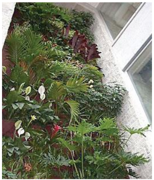
Fig.4 Vertical garden living wall.

Due to the diversity and density of plant life, living walls typically require more intensive maintenance (e.g. a supply of nutrients to fertilize the plants) than green facades. There are various forms of living walls, with the main differences occurring between interior and exterior designs.