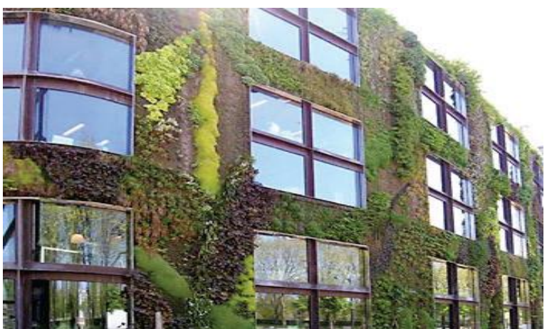
Fig.6 Vegetated Mat Wall

An 'active' living wall is intended to be integrated into a building's infrastructure and designed to biofilter indoor air and provide thermal regulation. It is a hydroponic system fed by nutrient rich water which is re-circulated from a manifold, located at the top of the wall, and collected in a gutter at the bottom of the fabric wall system. Plant roots are sandwiched between two layers of synthetic fabric that support microbes and a dense root mass.