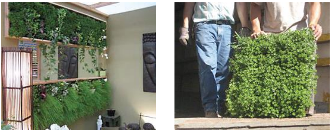
Fig.5 A living wall constructed from modular

A modular living wall system emerged in part from the use of modules for green roof applications, with a number of technological innovations. Modular systems consist of square or rectangular panels that hold growing media to support plant material. The composition of the growing medium may be tailored to the unique combination of plants selected, and to other design objectives. Most of the nutrient requirements for the plants can be found in the growing media within the modules. Irrigation is provided with these systems at different levels along the wall, using gravity to move water through the growing media. Modular systems are often pre-grown, providing an 'instant' green effect upon completion of the installation. Notice of between 12 - 18 months may be required to secure pre-grown modular systems.