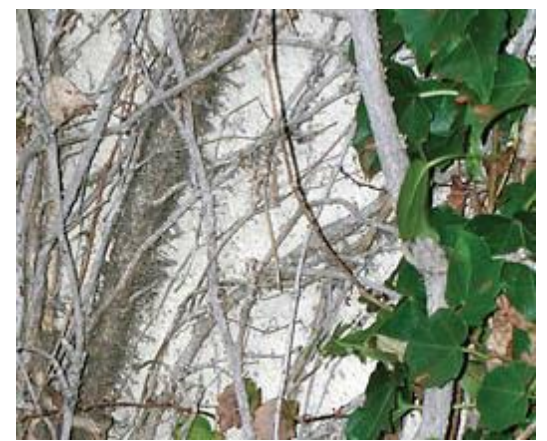
Fig.1 Boundary Ivy attaches to a building using aggressive adhesive suckers or climbing roots that can damage surfaces and enter voids and cracks

Technological innovations in Europe and North America have resulted in the development of new trellises, rigid panels and cable systems to support vines, while keeping them away from walls and other building surfaces. Two green facade systems that are frequently used are Modular Trellis Panel and Cable and Wire-Rope Net systems. Each of these systems is described below: